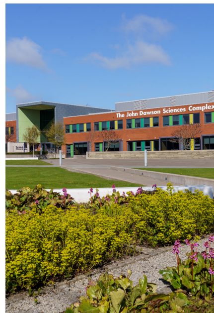
Top: Hope Street Xchange Bottom: The John Dawson Sciences Complex